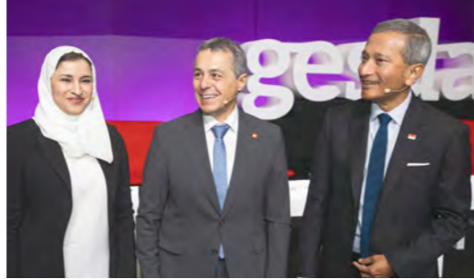
Federal Councillor Ignazio Cassis, overseeing GESDA within the Swiss government, surrounded by Ms Sarah Bint Yousif Al Amiri, Minister of State for Education and Advanced Technologies of the United Arab Emirates, and Mr Vivian Balakrishnan, Minister of Foreign Affairs of Singapore, during the political segment of the 2022 Summit.